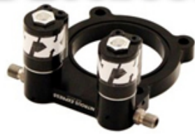
Plate System for 2.3L Ecoboost