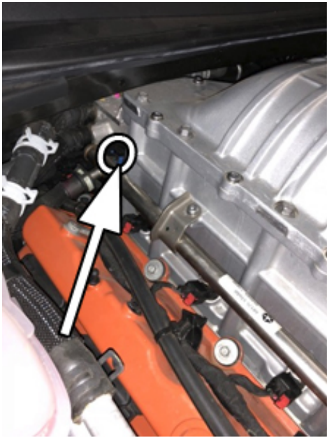
View from Top