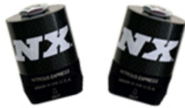
Plate System for 2v 4.6L engines