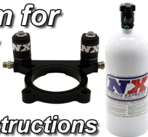
Plate System for FR-S & BRZ